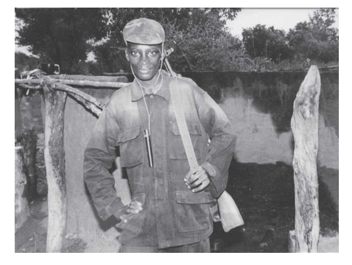
FIGURE 3. Ugandan soldier with pipe filter to prevent infection with Guinea worm disease.

Sweden, United Arab Emirates, and the United States, the Japanese businessmen's consortium Keidanren, HDI, the Bill and Melinda Gates Foundation, and the WHO.